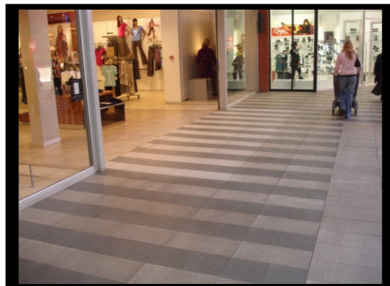
"Deep cleaning of entrance to one of the Pretoria Truworths stores"