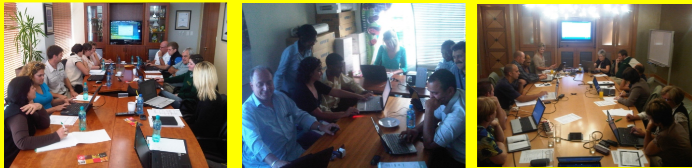
CRM TRAINING IN KZN, BOTSWANA & FREE STATE